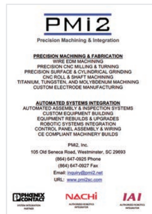
Heat Sheet Ad • promote your business information and add a coupon also