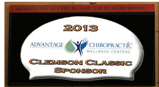
Meet Scoreboard Advertisement