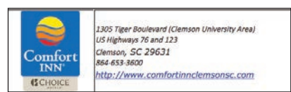
CAT Website Listing